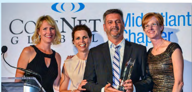
Best New Workplace Solution Award - Little and BAE Systems

This event would not be possible without the support of our sponsors: